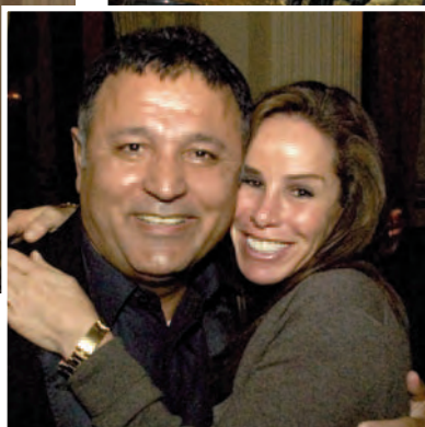
Melissa Rivers and Elie Tahari, dinner co-chairman.